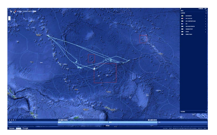
Global Fishing Watch: Individual Vessel Track Showing Fishing Activity