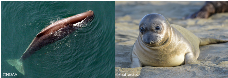
Above: Left: Sperm whale; Right: Elephant seal pup at Big Sur. Far Right: Top: Humpback whale; Middle: Long-beaked common dolphins in Monterey Bay; Bottom: Swordfish.

This is a chance to make a tangible difference by getting large-mesh drift gillnets off the water permanently, while supporting local fishermen and ocean wildlife.