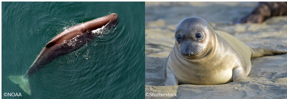
Above: Left: Sperm whale; Right: Elephant seal pup at Big Sur. Far Right: Top: Humpback whale; Middle: Long-beaked common dolphins in Monterey Bay; Bottom: Swordfish.

This is a chance to make a tangible difference by getting large-mesh drift gillnets off the water permanently, while supporting local fishermen and ocean wildlife.