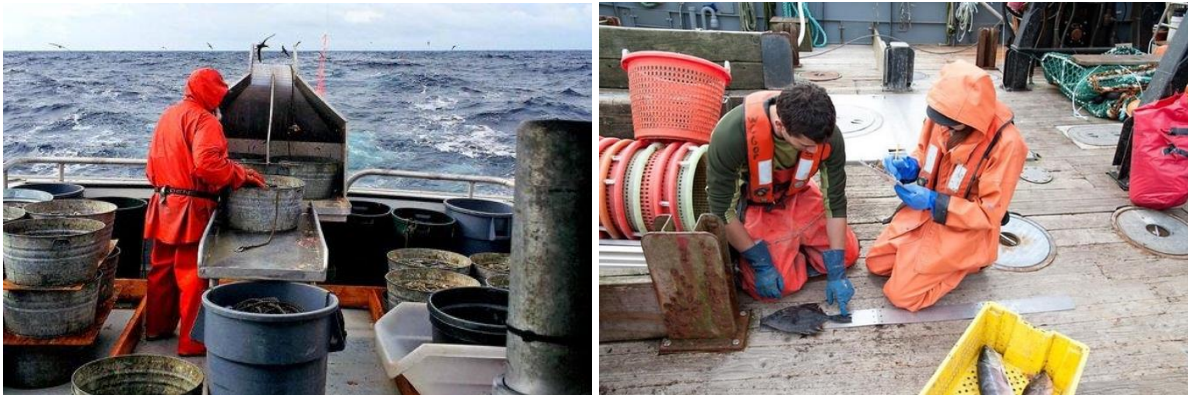
Fishery observers on vessels recording fish length.

There are many different observer programs that can be implemented for fishery observation; the type of program is dependent on which questions the observer program is trying to answer. When setting up a fishery-specific observer program it is important to consider how human observation can provide the data needed to ensure bycatch is tracked and accounted for as much as possible. This section explores critical aspects of existing federal observer programs to inform a potential state-run pilot observer program.