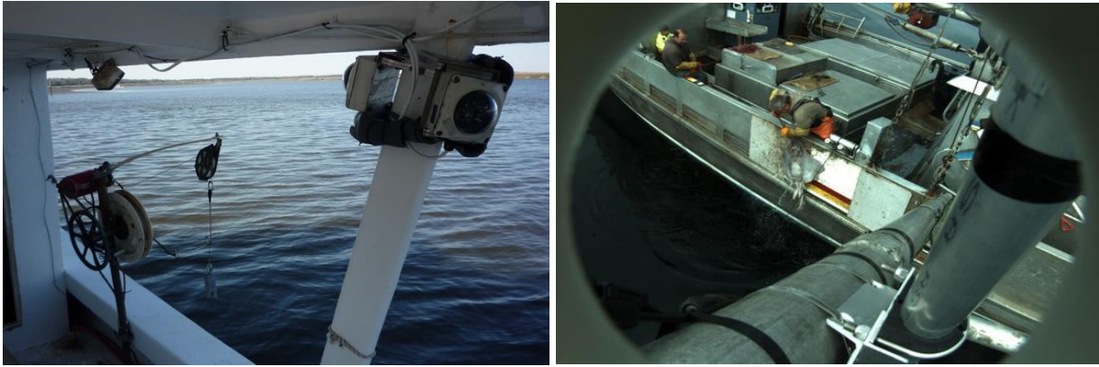
Electronic monitoring systems installed on fishing vessels.