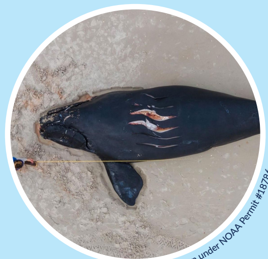
© Tucker Joenz, taken under NOAA Permit #18786

Collisions with boats are the other leading cause of right whale deaths. North Atlantic right whales are slow, swimming around 6 miles per hour, usually near the water's surface. They are also dark-skinned and lack a dorsal fin, making them very difficult to spot, especially in unfavorable weather conditions or at night. Studies have shown that boat speed is a major factor in whale collisions and that slowing boats larger than 65 feet down to 10 knots would reduce a North Atlantic right whale's risk of death from being struck by a large vessel. At normal operating speeds, boats cannot maneuver to avoid hitting right whales, and the whales swim too slowly to be able to move out of the way. This puts right whales at great risk of strikes, which can cause deadly injuries from blunt force trauma or cuts from the propellers. Between 2017 and March 2025, there have been 15 confirmed deaths of North Atlantic right whales in the U.S. and Canada from boat strikes and three confirmed serious injuries from boat strikes.