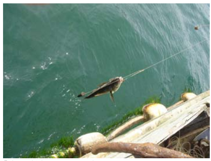
Fish caught during our research.

In Chile, as in other parts of the world, the fish farms and cages are surrounded by a wide range of marine ecosystems,