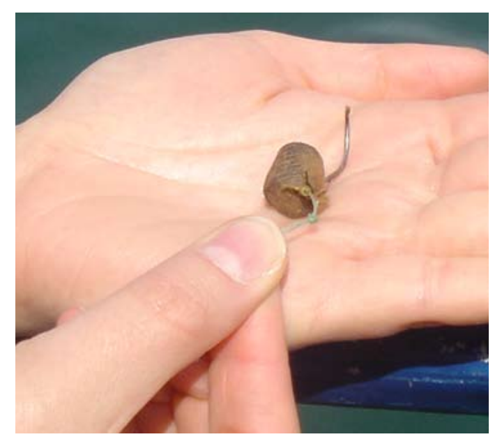
Pellets used to catch the species used for research purposes.

The analysis also found 87 parts per billion of Oxitetraciclina in a False jacopever, which did not contain any pellets used to feed salmons in its intestine.